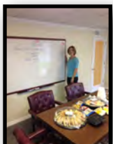
Providing lunch for staff!